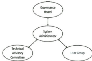
Figure 1: Governance Structure